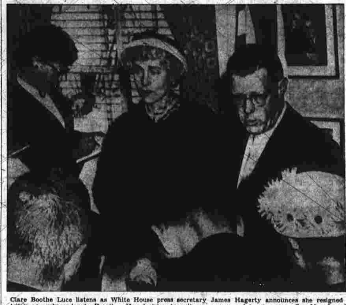
Clare Boothe Luce listens as White House press secretary James Hagerty announces she resigned today as ambassador to Brazil. Her decision to quit was announced to newsmen after Mrs. Luce conferred with President Eisenhower for more than an hour.